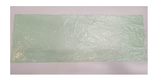
Step 1: Smooth out the bag and fold it lengthwise two times.